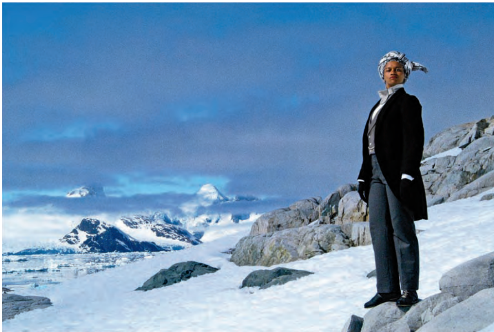
Del LaGrace Volcano, Moj of the Antarctic: On the Mountain, Antarctica, 2005 , giclée print, 30 x 36 in. (76.2 x 91.4 cm) (artwork © Del LaGrace Volcano)

Hayward, Eva. “More Lessons from a Starfish: Prefixial Flesh and Transspeciated Selves.” WSQ: Women’s Studies Quarterly 36, nos. 3–4 (Winter 2008): 64–85.