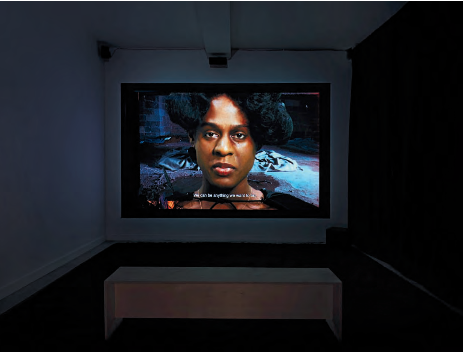
Tourmaline, Salacia, 2019 , 16 mm film, color, sound, 6:04 min., installation view, Chapter, NY (artwork © Tourmaline; photograph by Dario Lasagni, provided by the artist and Chapter NY, New York)